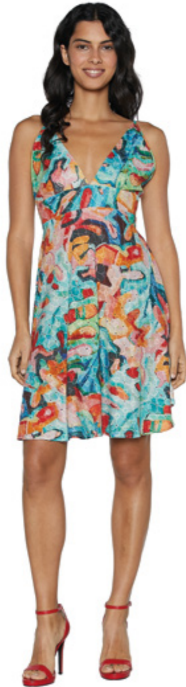
S26D328 SHORT DRESS SM-ML 100% COTTON BRODERIE