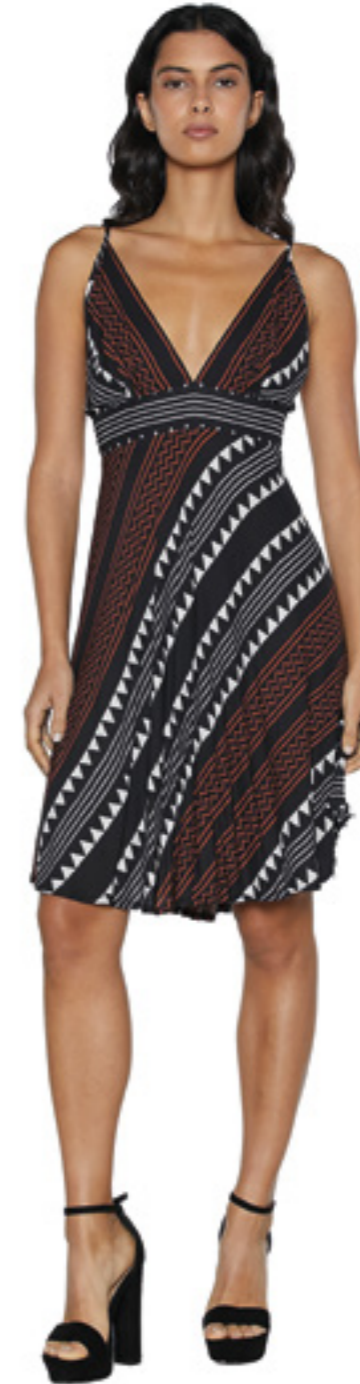
S26D341 SHORT DRESS SM-ML 100% VISCOSE