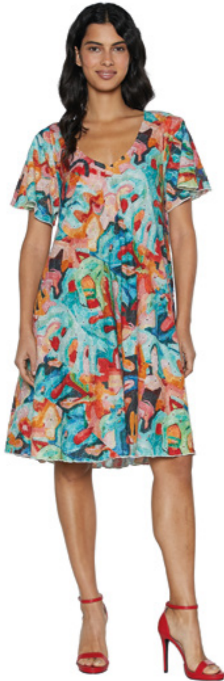
S26D326 SHORT DRESS SM-ML 100% COTTON BRODERIE