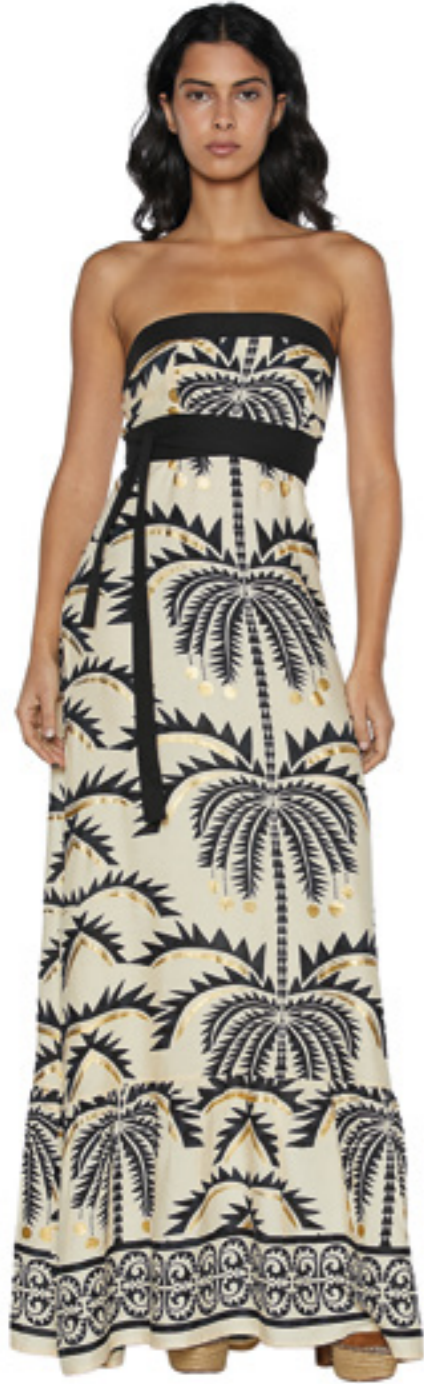
S26D708 LONG DRESS SM-ML 100% VISCOSE