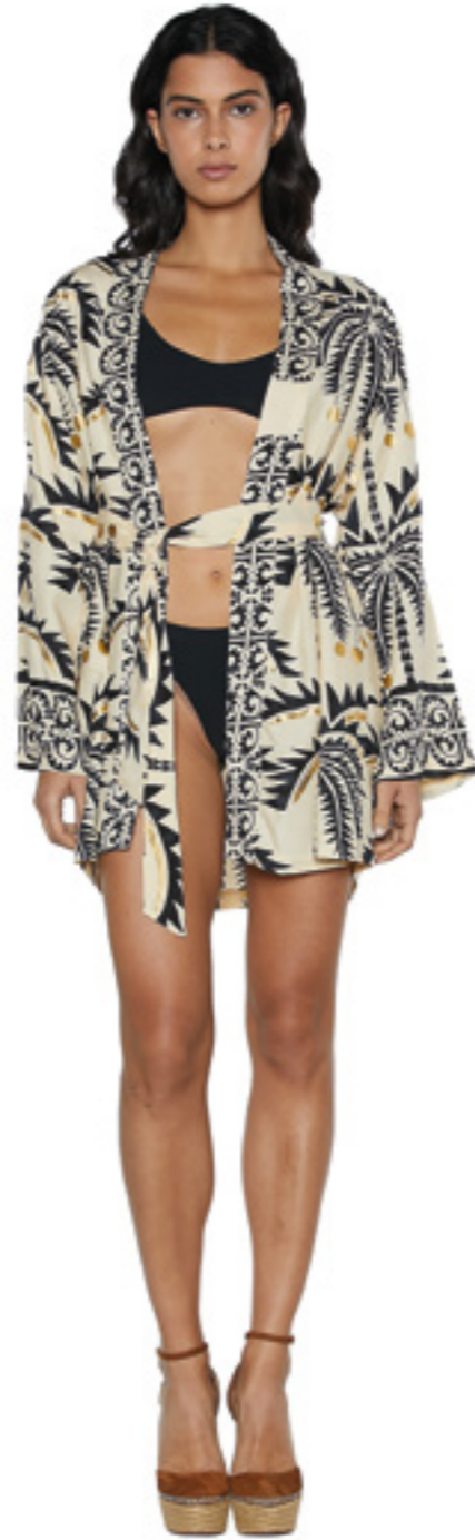
S26C700 KIMONO SM-ML 100% VISCOSE