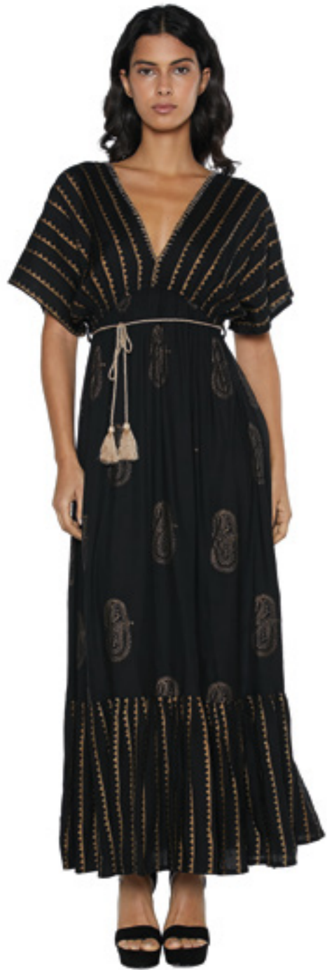
S26D502 SHORT DRESS SM-ML 100% COTTON CAMBRIC