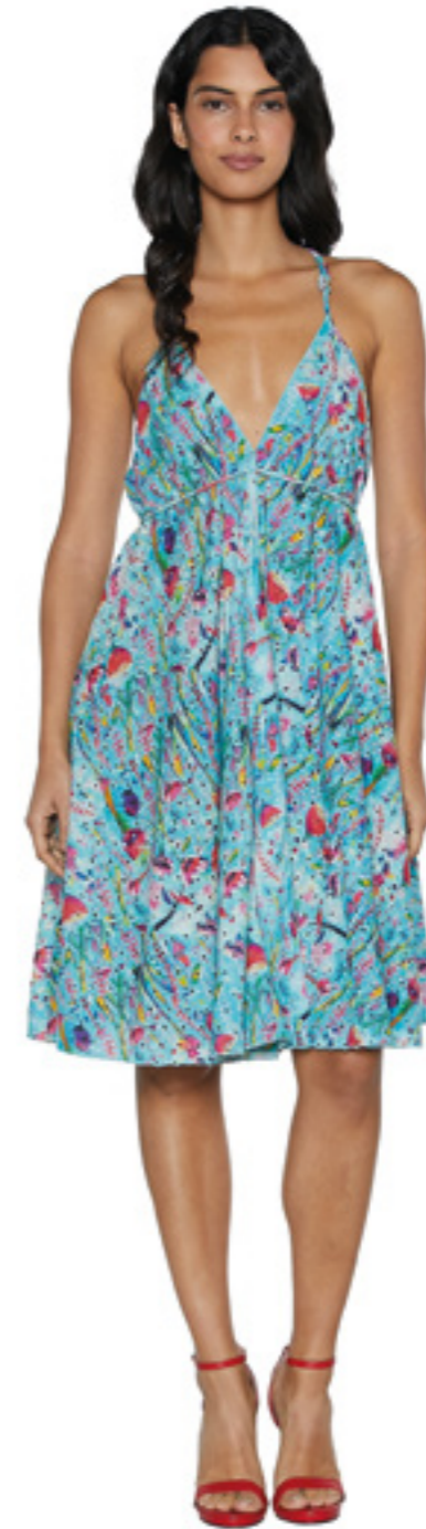
S26D321 SHORT DRESS SM-ML 100% COTTON BRODERIE