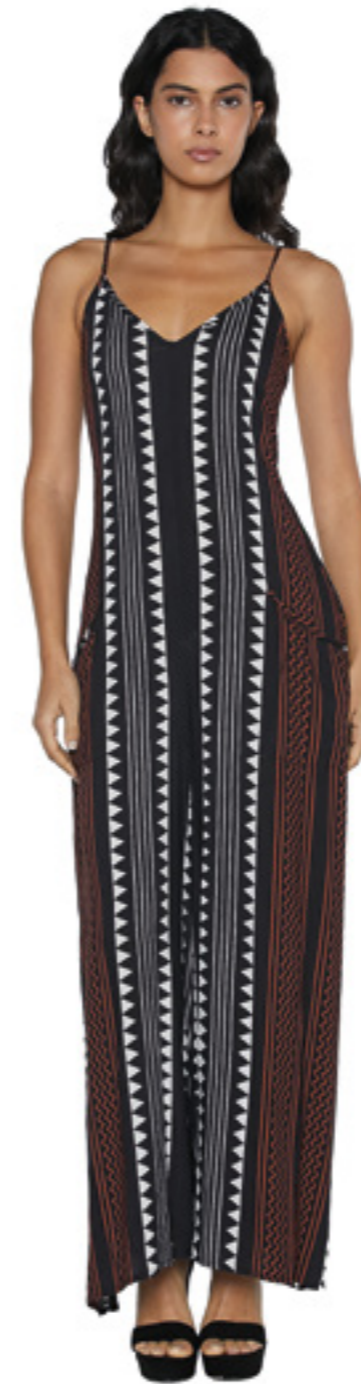
S26D335 JUMPSUIT SM-ML 100% VISCOSE