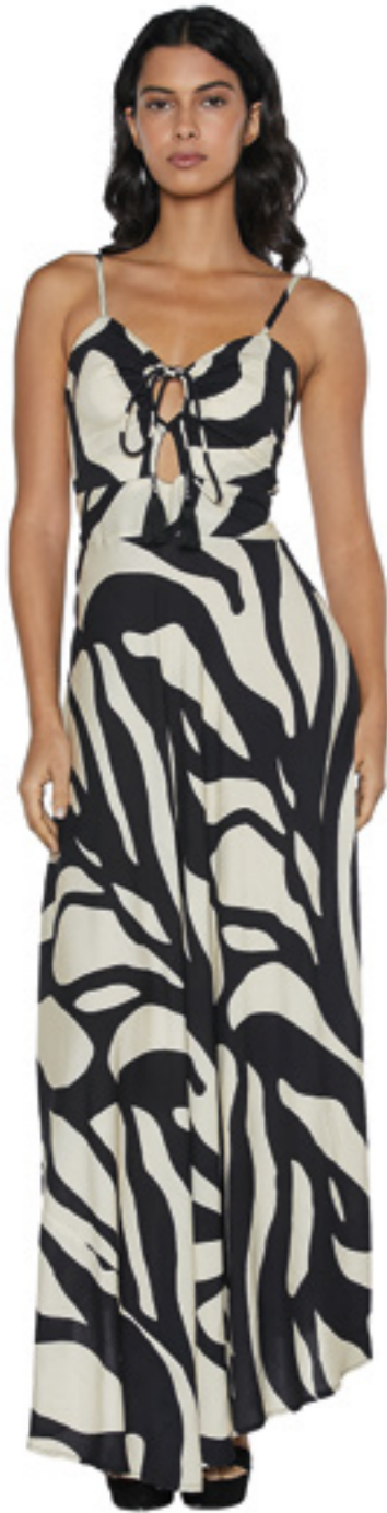
S26D327 LONG DRESS SM-ML 100% VISCOSE