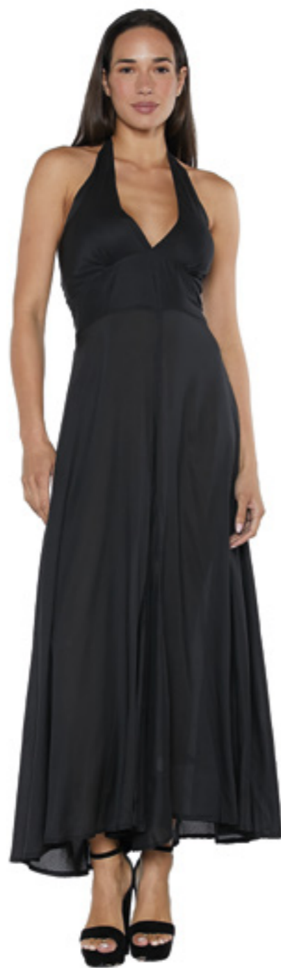
S26D416 LONG DRESS SM-ML 100% VISCOSE MODAL