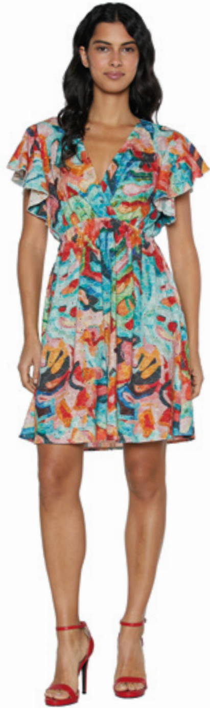
S26D340 SHORT DRESS SM-ML 100% COTTON BRODERIE