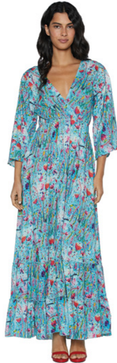
S26D333 LONG DRESS SM-ML 100% COTTON BRODERIE