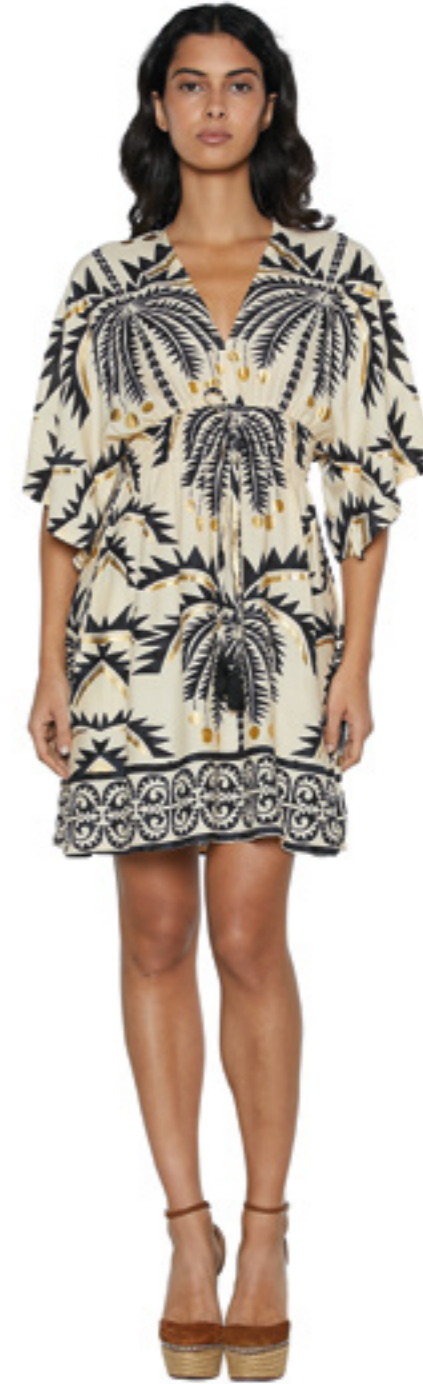
S26D716 SHORT DRESS SM-ML 100% VISCOSE