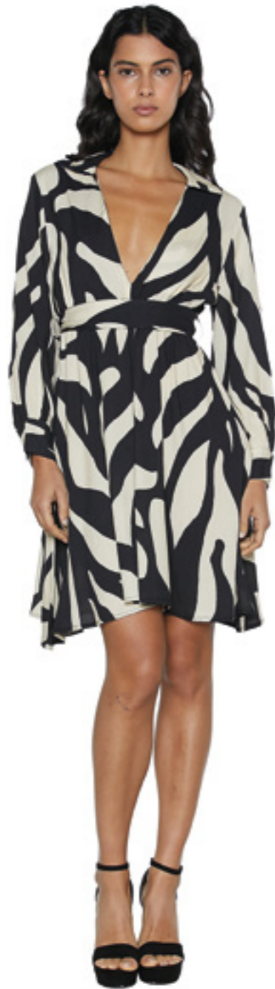
S26D347 SHORT DRESS SM-ML 100% VISCOSE