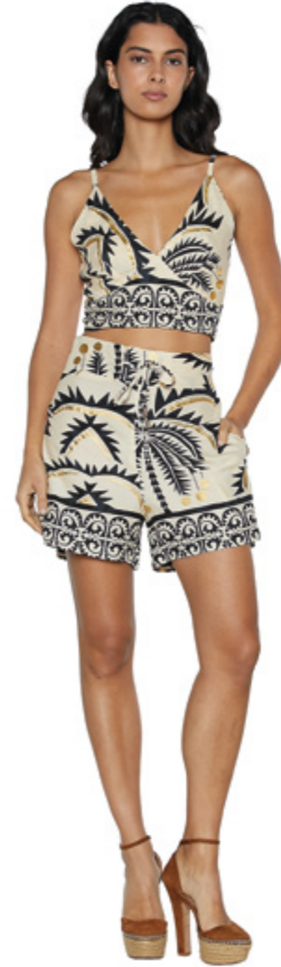
S26P708 SHORTS SM-ML 100% VISCOSE