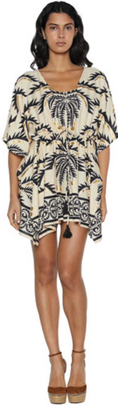
S26T709 KAFTAN FREE 100% VISCOSE