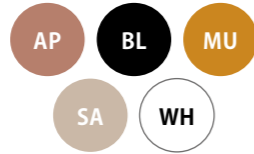
S26D310 LONG DRESS SM-ML 100% COTTON VOIL