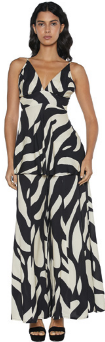
S26P312 PANT SM-ML 100% VISCOSE