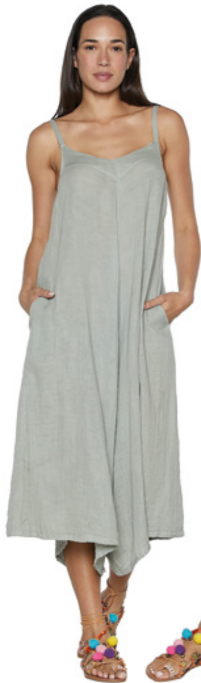
S26D202OR SHORT DRESS SM-ML 100% COTTON VOIL AQ JE OR